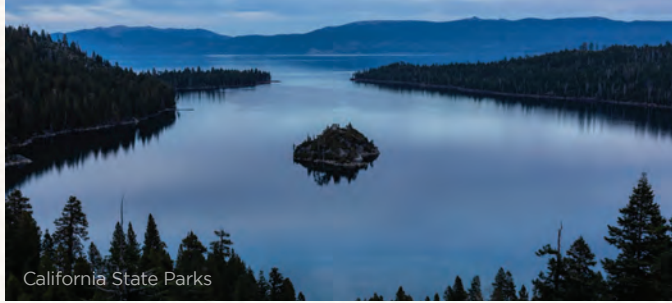
California State Parks