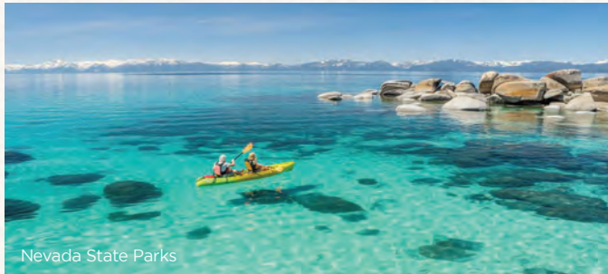
Nevada State Parks